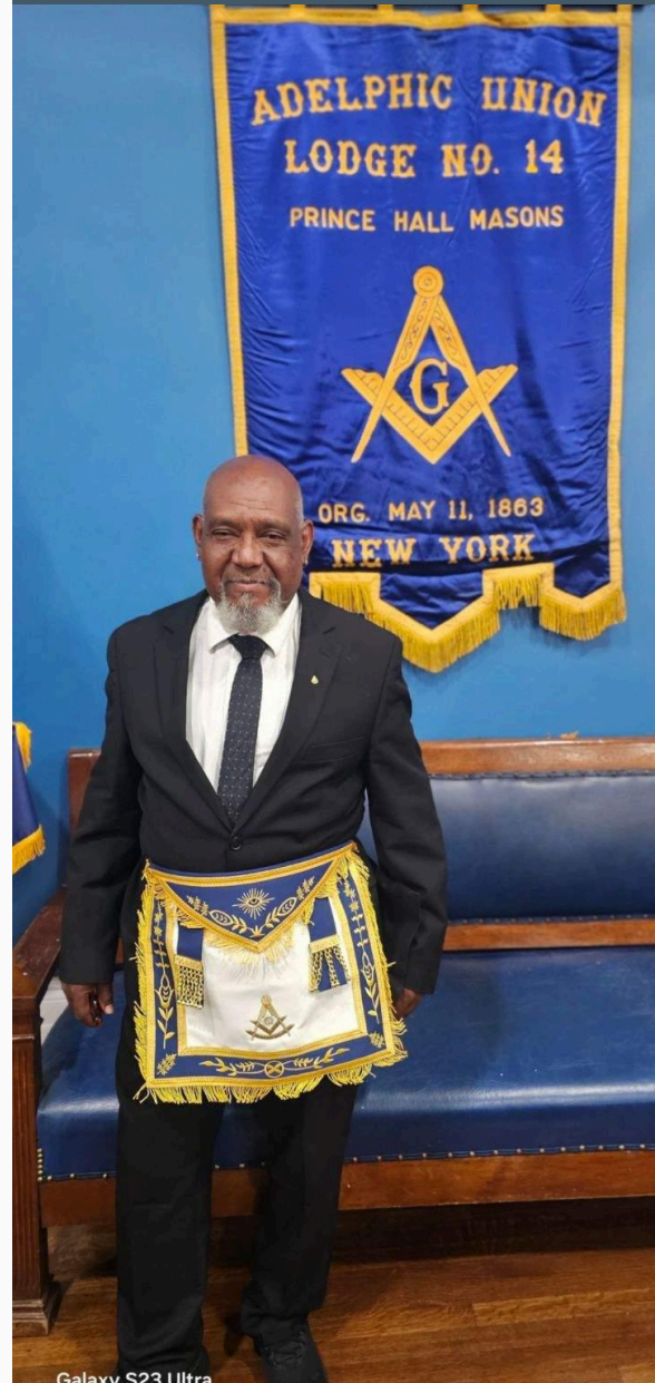
Galaxy S23 Ultra